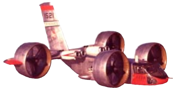
Photo of the Bell X22A Aircraft featured in Stan Kakol's presentation last month.