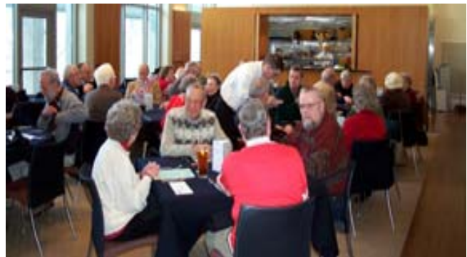
Attendees at the Cincinnati Art Museum enjoy lunch prior to the afternoon tours.