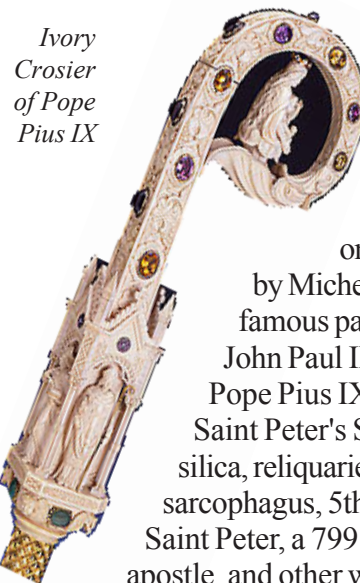
Ivory Crosier of Pope Pius IX

More than 350 objects-the largest Vatican collection never to tour North America-are presented in the context of dramatic and immersive environments, including representations of the Tomb of Saint Peter, The Sistine Chapel, the ancient and current Saint Peter's Basilicas, and other settings. From culture to history to art, explore how the institution has impacted-and been impacted by-the world throughout the centuries.