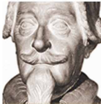
Bust of Pope Alessandro VII

Experience the history and beauty of the Vatican through a once-in-a-lifetime opportunity to view its extraordinary collections of art and historical objects, including many never before on view to the public. Works by Michelangelo, Bernini, Giotto, Canova and others, and objects dating back to the third century, provide a fascinating and unprecedented insight into the Vatican's history.